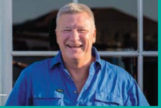
Scott Cam: HIA's newest brand ambassador p.8